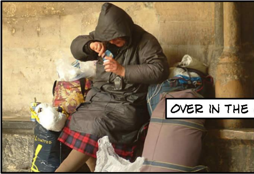
OVER IN THE CITY